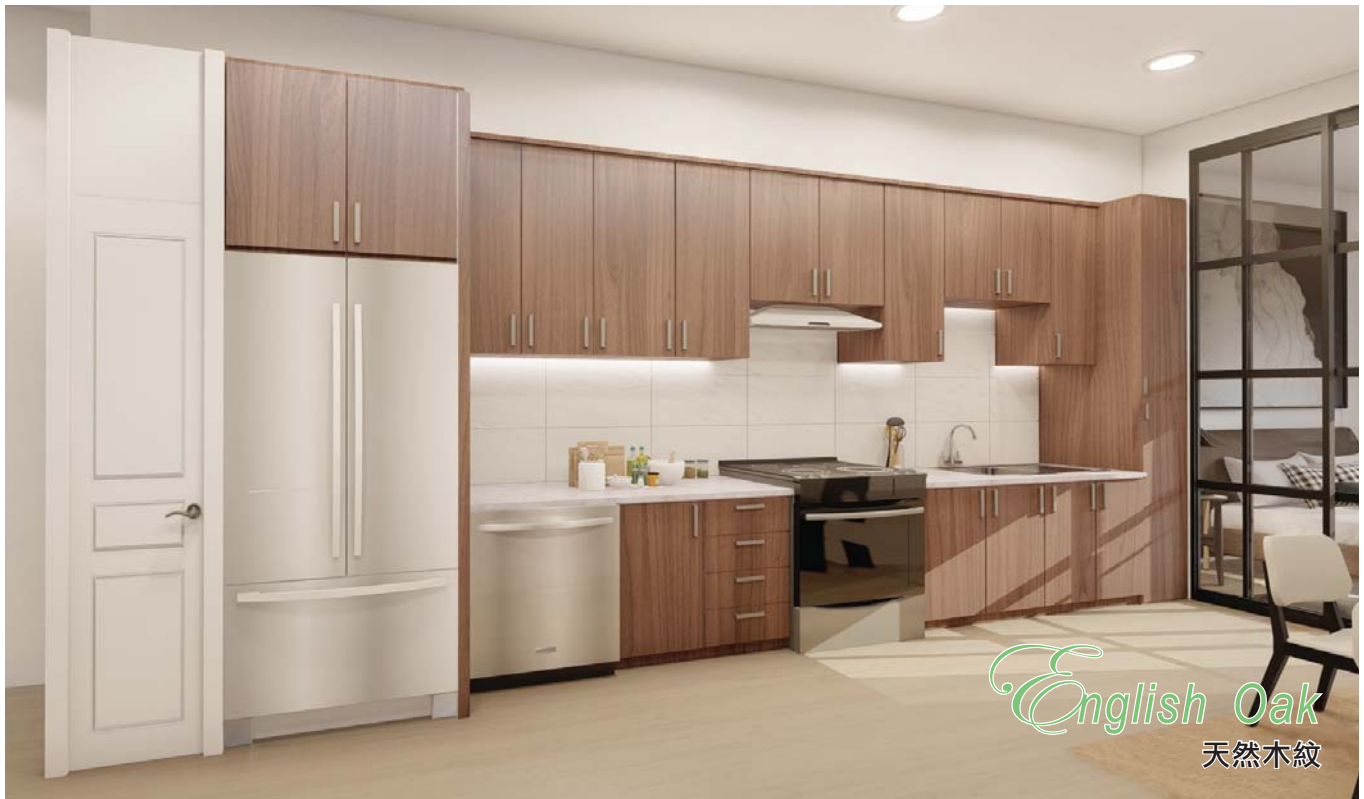
English Oak 天然木紋