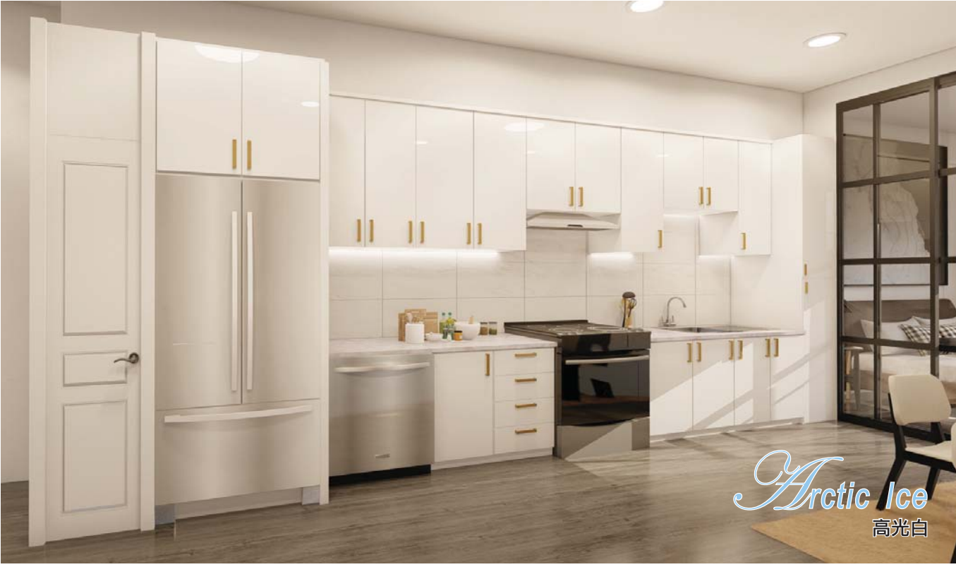
Arctic Ice 高光白