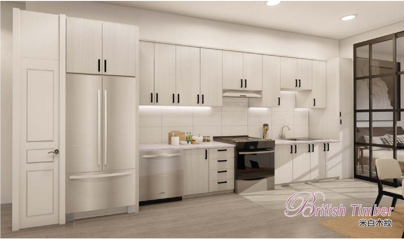
British Timber 米白木紋