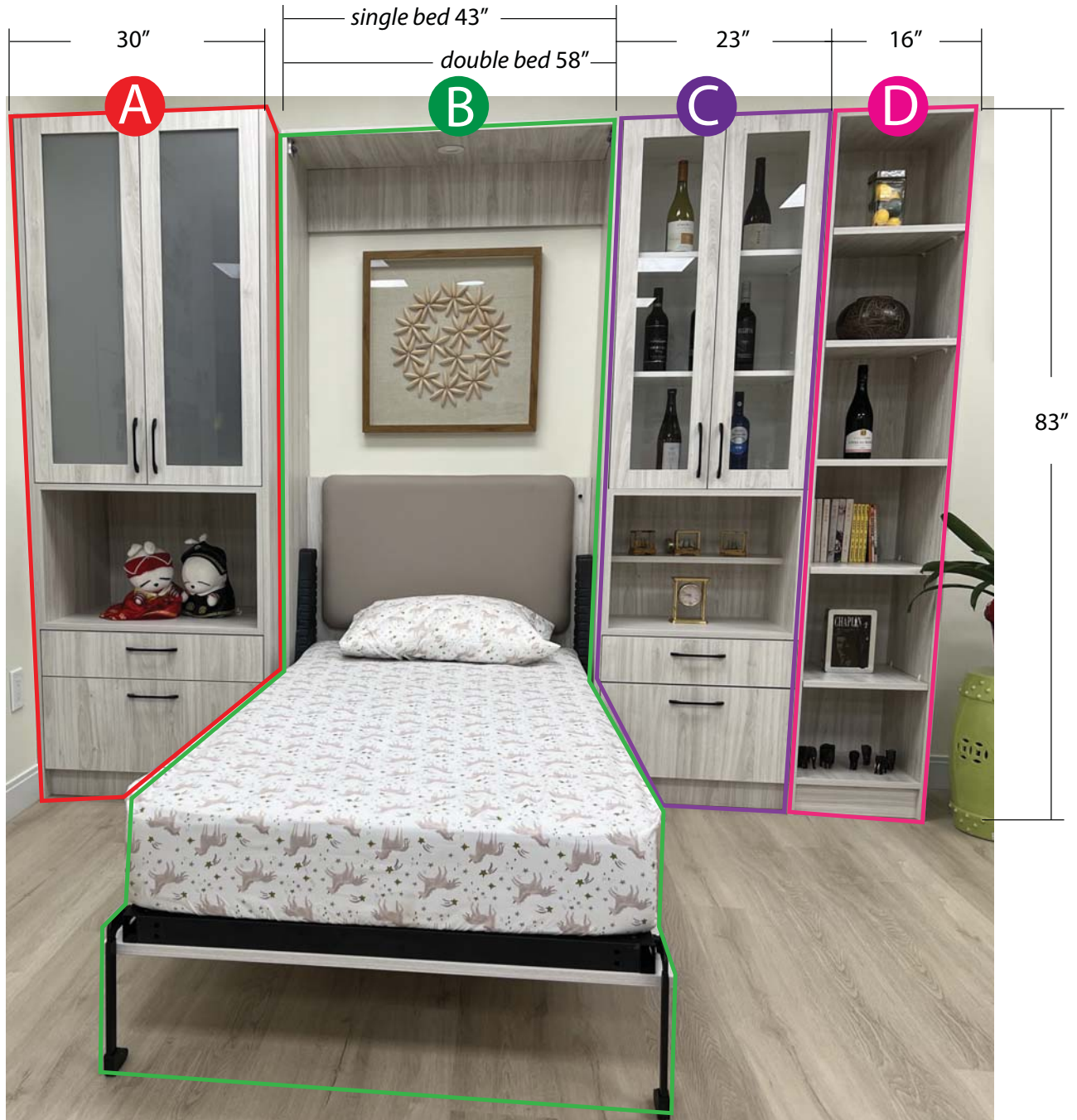
A. Closet Cabinet