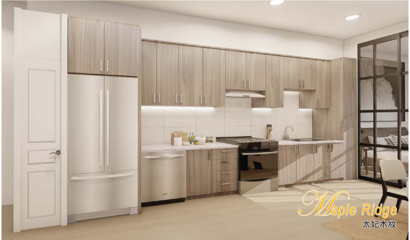
Maple Ridge 太妃木紋