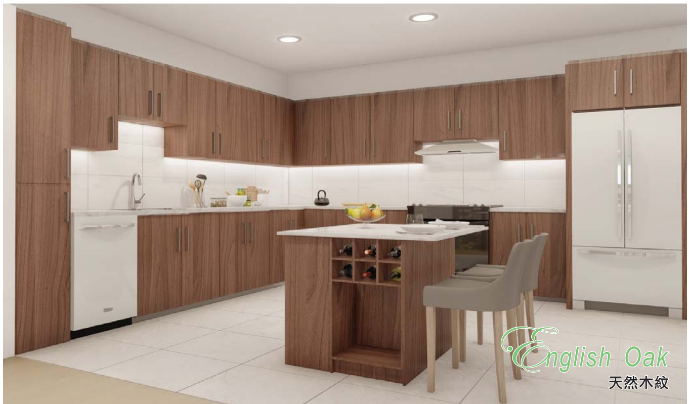
English Oak 天然木紋