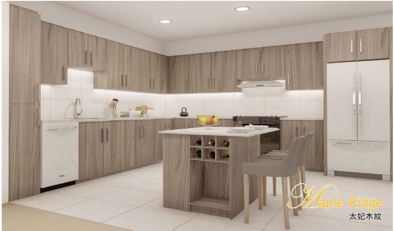
Maple Ridge 太妃木紋