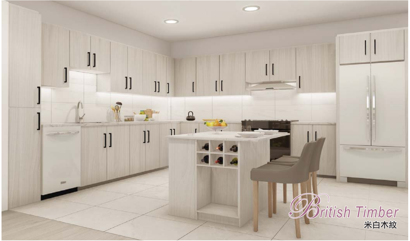
British Timber 米白木紋