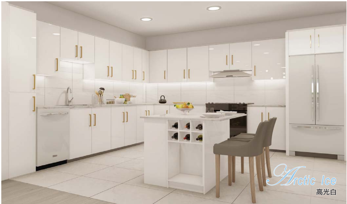
Arctic Ice 高光白