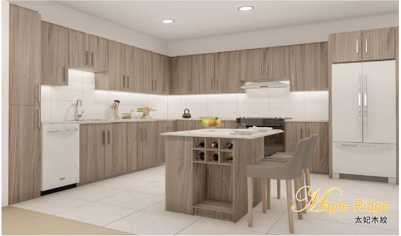
Maple Ridge 太妃木紋