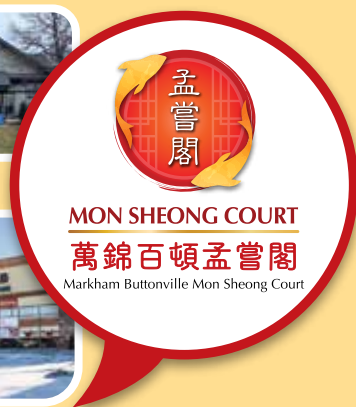
MON SHEONG COURT 萬錦百頓孟嘗閣 Markham Buttonville Mon Sheong Court