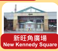
新旺角廣場 New Kennedy Square HSBC 滙豐銀行