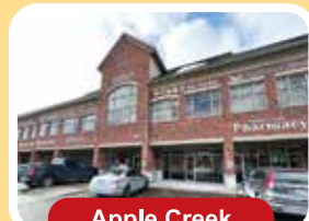
Apple Creek Medical Plaza