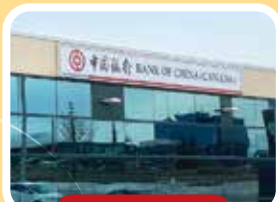
中國銀行 Bank of China