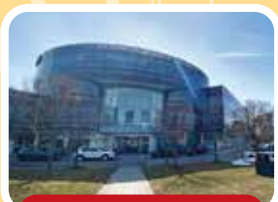
金貿中心 Commerce Gate