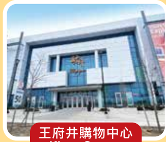
王府井購物中心 Kings Square