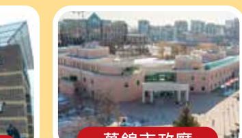
萬錦市政廳 City of Markham