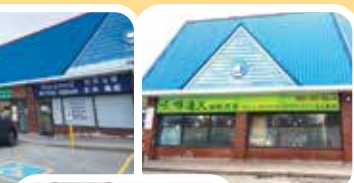
餐廳及理療中心 Restaurant & Wellness Centre