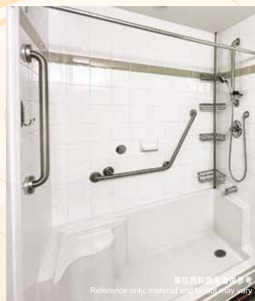
單位用料圖像僅供參考 Reference only, material and layout may vary