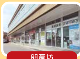
朗豪坊 Langham Square T&T超級市場