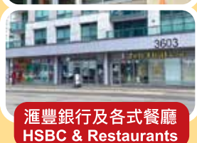
滙豐銀行及各式餐廳 HSBC & Restaurants