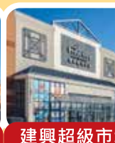
建興超級市 FreshWay Food