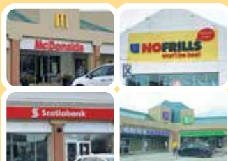
Markham Town Square