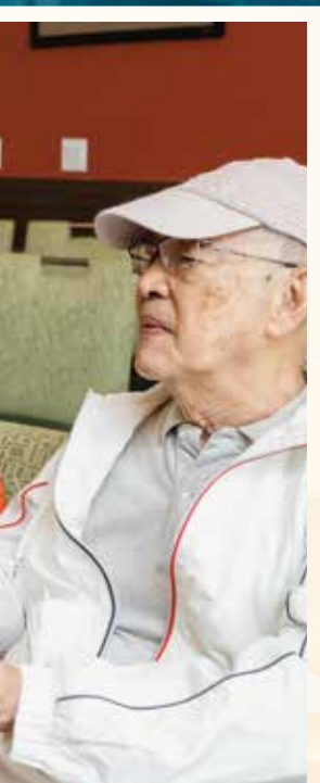
孟嘗閣住客休閒下午茶