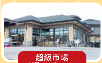
超級市場 Village Grocer