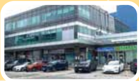
時代廣場 Times Square