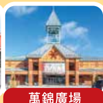
萬錦廣場 First Markham Place