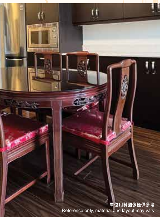
單位用料圖像僅供參考 Reference only, material and layout may vary