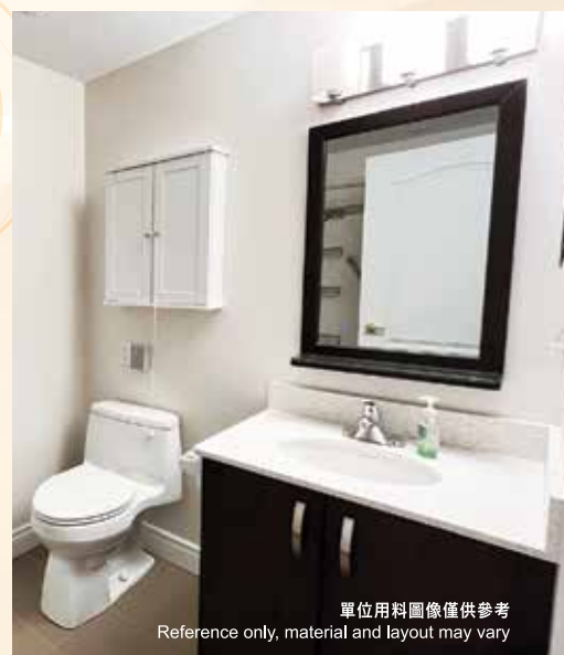
單位用料圖像僅供參考 Reference only, material and layout may vary