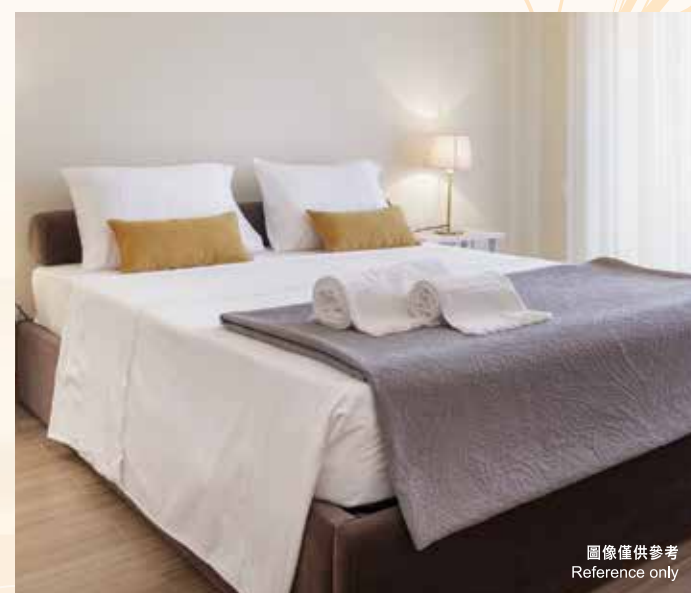
圖像僅供參考 Reference only

A special appeal is the walk-in shower stall with a heated pot light, molded seat, shower wand and high-quality grab bars. It is the latest in modern conveniences to provide safer and easier in and out of the shower than ever before.